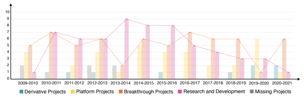
Figure 2. Distribution of project design briefs into the four types of projects between 2009 and 2021

However, examining change over time, a decrease in Research and Development Projects was noted from 2014 to 2021. Breakthrough Projects proved to be consistently prominent during the period observed. Similarly, Derivative Projects remained rare in the course throughout the study period (at an average of 6%). Platform Projects, in turn, fluctuated considerably, ranging from 0% (2010-11) to 50% (2019-20). Mapping how the industry project brief categories have shifted over time may allow the prediction of the project types that the students might encounter, and thus improve planning and course management. The mapping also showcases the nature of the collaboration between Industry and Academia, contributing to a better understanding of both industry's evolving and the requirements of project teams. Figure 3 illustrates the results of the analysis of three academic years in order to provide a longitudinal perspective through the lens of three sets of PdP project samples (total number of projects included n=42)<sup>2</sup>. These were a 2020 – 2021 sample (illustrated in the radial matrix as blue), a 2015-2016 sample (illustrated in orange) and a 2011-2012 sample (illustrated in pink). An average line was drawn representing the distribution of disciplines over the three sample sets analysed.