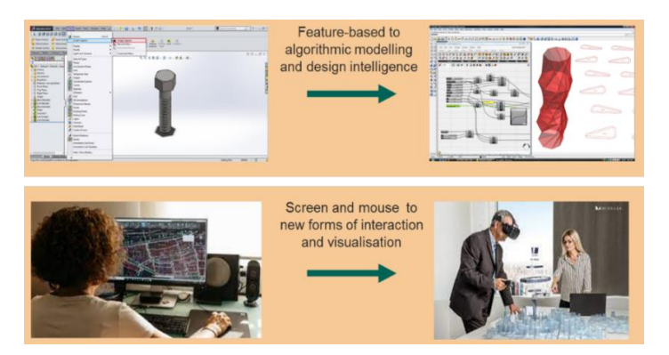
Figure 1. Algorithmic modelling (top) and interaction trends (bottom)

As CAD modelling has become more complex, there has been more of a push towards menu-driven interaction with highly-developed user friendly interfaces, but it remains a demanding task to become fluent in a particular CAD package [2, 3]. In contemporary use of CAD, we can identify two key developments: algorithmic modelling and advanced interaction (Figure 1). One is related to the logic and intelligence implicit in the construction of the design model. The other is oriented around crossing the physical-digital barrier and effective means of digital capture, communication and visualization allowing designers to explore design space more easily and fully.