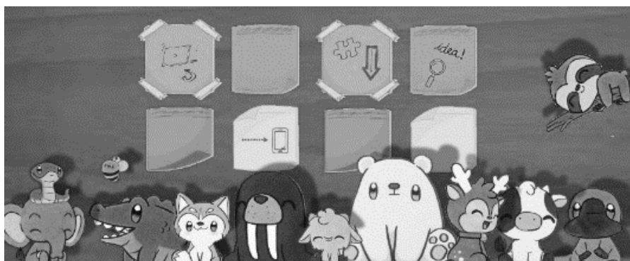
Figure 2. Game universe

The game is dedicated to children. So playful and motivational tools are quite essential [9]. That is why we used the Lino narrative frame. Lino is a young fox who dreams of a product and spends the following day shaping his product idea with his friends, teachers, and parents. His school day rhythms the game. For the aesthetic and attractive aspect, we used a graphical charter adapted, with cute animals (Figure 2).