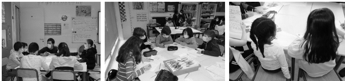
Figure 4. Photos taken during the case study

The class was organized in work islands to foster teamwork (Figure 4). The process presented Figure 5 was used. The designers' team (5 members) supervised the game and the children by explaining the rules and answering their questions. Both classes were free to create whatever they wanted, regardless of feasibility. In the third-grade class, one supervisor was assigned to one group.