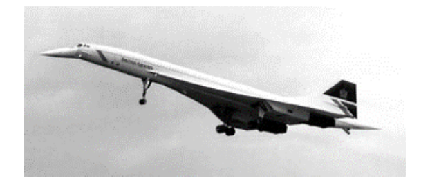
Figure 4. Concorde

Nothing like Concorde had ever been attempted before. The technical problems were immense. All parts were designed using 2D systems to represent 3D parts. Only the most basic computer systems existed, so nearly all calculations were carried out manually. The designers could only dream of Finite Element Analysis (FEA) and virtual mock-ups. Therefore, as Mr. James Hamilton, the Director-General (Concorde) at the Ministry of Aviation said 'This airplane was the most tested airplane of all time. We had rigs for everything.... we were putting all the systems together under real flight conditions for the first time, you can never be quite sure' [14].