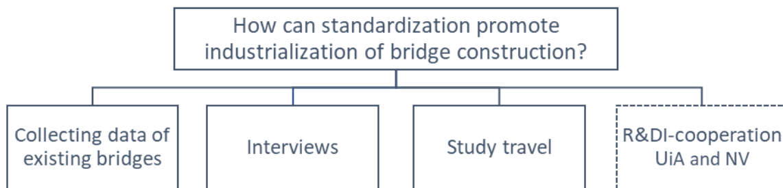
Figure 1. Methods used in the master project

Methods used in the project are shown in Figure 1.