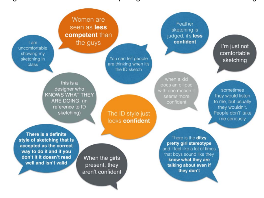
Figure 3. Perceptions Industrial Design Sketching & Confidence