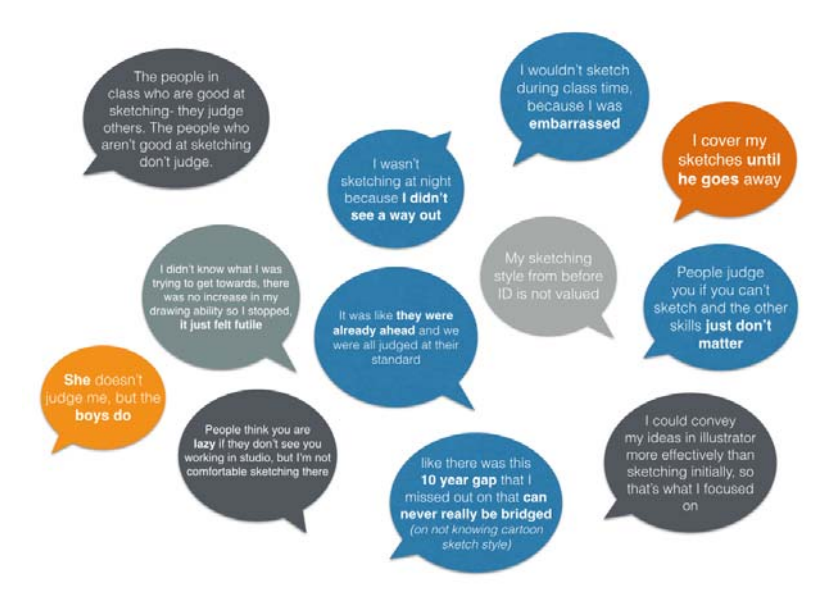
Figure 4. Examples of Impact of ID Sketching in Studio and Education

This last statement goes back to the literature Bandura produced theorising that if someone doesn't see themselves fitting into skill set skill set, or don't perceive themselves as skilled in that specific task, they are less likely to work on that skill and pursue it [18,19]. This study does not directly show this correlation, but from comments in the interviews discussing a feeling of futility and a perception of a lack of growth from sketching alone after hours, it is something to be investigated further in the future.