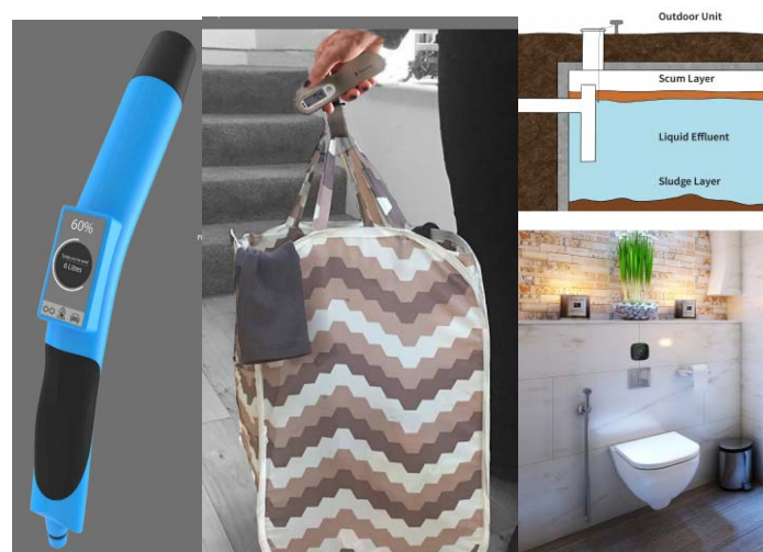
Figure 1. Students' Sustainable Products for the Developed World: (From left) Smart Hose, Laundry Scale and Septic Tank Monitor

for washing a car or watering a garden show the user an increasing percentage of a recommended volume that they should use for those tasks. A universal mode provides a basic “volume expelled” metric, which aims to simply make the user more conscious of the water they are using. A second student designed a laundry scale to optimise washing machine usage. The scale is calibrated to the washing machine model and the user then aims to fill the machine with the optimal load-weight for a cycle. This aims to reduce wasted water caused by underweight loads and increase the lifespan of the machine by avoiding overweight loads. A third student identified a growing issue with septic tanks, where overuse of antibacterial cleaning agents reduces a tank’s efficiency. Alternative cleaning agents and bacteria “bombs” can mitigate this. This student developed a monitor to help users maintain the right amount of bacterial activity in their septic tank.