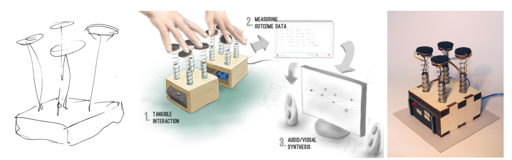
Figure 1. Tangible Pod interface and prototype

The Tangible Pods interface (TP-IF) (Figure 1) was developed for audio and haptic feedback, while RST focused on the development of HDT's for visual and haptic visualization, ideation and conceptualization in earlier and ongoing work. Theoretical background and framework references were implemented in the concept and final design of the TP-IF. The TP-prototype supports intuitive experimentation and expression in sound through tangible physical interaction. The interface could also be applied for combinatorial visual and audio feedback, however the focus is placed on synthesizing sound.