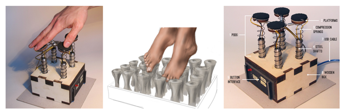
Figure 2. Tangible Pods concept and full functional prototype

The TP consists of multiple "pods" that form a surface and can be physically manipulated/sculpted to create input data. It is a flexible interface that can be used in a range of applications including music, 2-D and 3-D modeling (Figure 2).