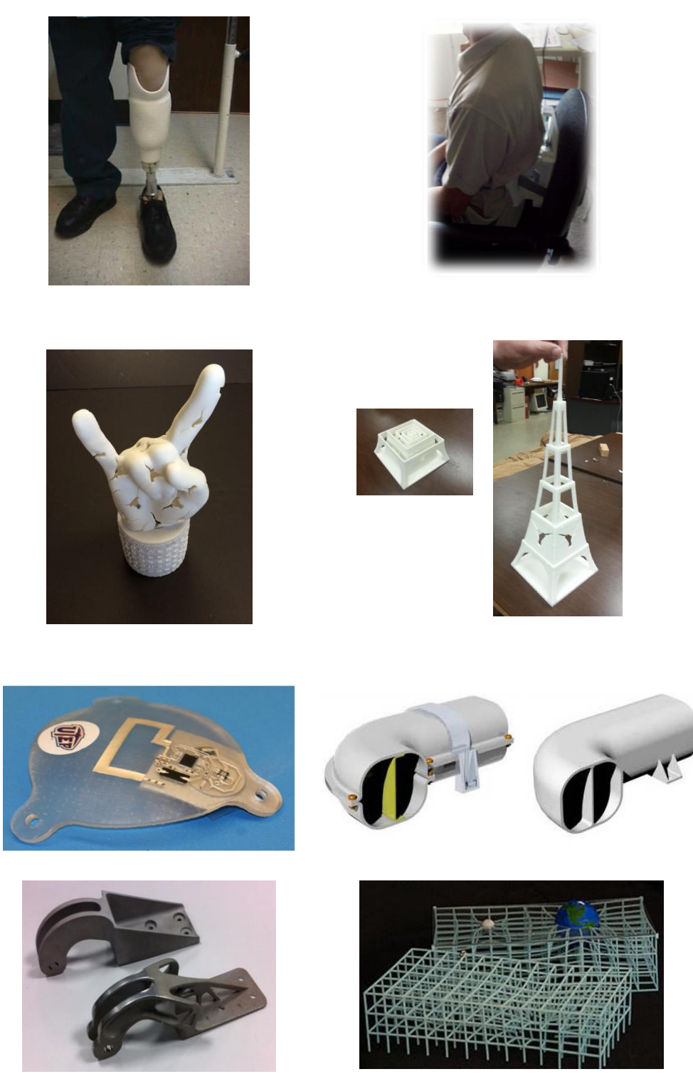
Figure 4. Exemplar parts that illustrate design opportunities with AM. Clockwise from the upper left: A prosthetic customized to fit the residual limb of the amputee (courtesy of Crawford, Neptune, et al., UT Austin); a custom-fit back brace (courtesy of UT Austin); an expandable part that builds in a limited build space and then expands into a tower larger than the build chamber, making use of compliant snap fits to fix the part in its deployed shape (courtesy UT Austin); an aircraft duct illustrating consolidation of multiple parts into one single AM part (courtesy of Boeing); a lattice structure illustrating the gravitational field around the earth and the moon (courtesy of UT Austin); an aircraft engine bracket lightweighted from topology optimization and fabricated with DMLS (courtesy of GE/EADS); a helmet insert with direct write metal wiring integrated into a stereolithography part (courtesy of MacDonald et al., UTEP); a cryptex with interlocking rings that function as fasteners (courtesy of UT Austin)