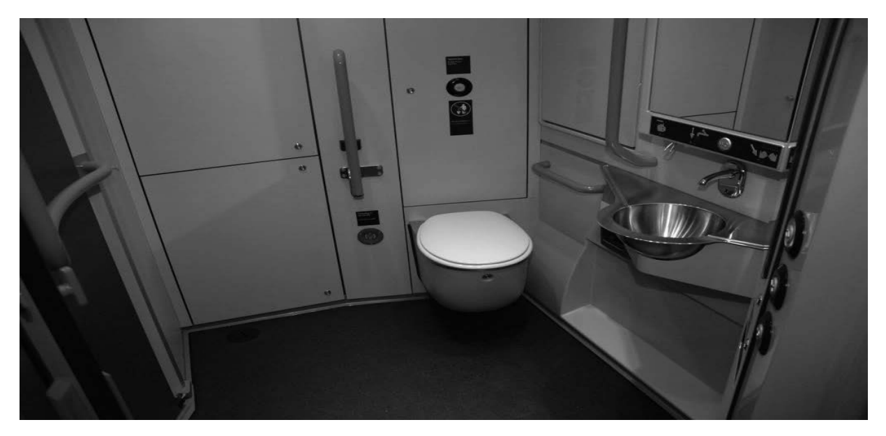
Figure 3. Taken on the train between Lillestrøm and Oslo