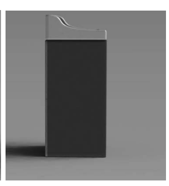
Figure 4. Sketch of example sink