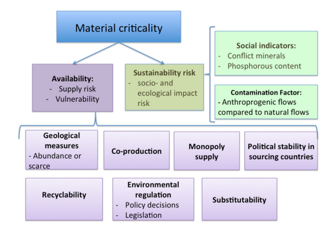
Figure 3. Aspects in the different evaluation methods