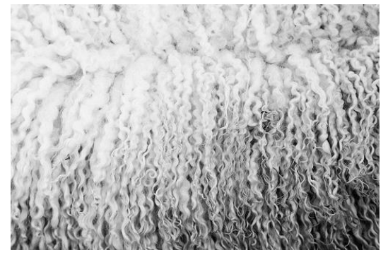
Figure 1: A clear picture of crimp of wool fibers

diameter of more than 28 micron is too coarse to be comfortable in next to skin garments [1]. Coarse wool is therefore mostly used in other products, and the lowest qualities go into technical products like house insulation. Wool fibers are covered in scales (Figure 2) which are the reason why wool will felt when exposed to heat, water and mechanical movement.