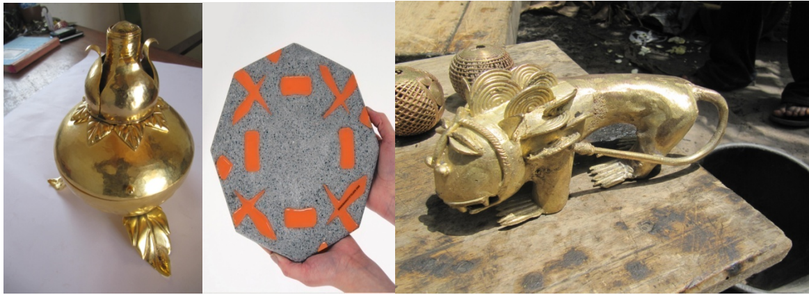
Figure 2. A B C A: A Jewellery Box, by (Augustine A. Frimpong). B: Concrete tile, by (Kjersti Holjem) C: The "Asanteman lion", by (Augustine A Frimpong)

The images in Figure 2, ABC are part of the data collected in the case study; they show how some student designs have been influenced by cubism. The findings from this participatory design shows how this stage of the research examined how certain categories of people, that is, design students and people outside the design field, view the role of Cubism in design. The purpose of this was to involve all stakeholders in design, both people who design and those who use designed works. The outcome also showed that most design students had used cubism in their works but they not know, reasons ranged from not knowing what it was to reasons such as liking the complexity of cubist works. The images in Figures 3 and 4 are images from the participatory design stage of the research.