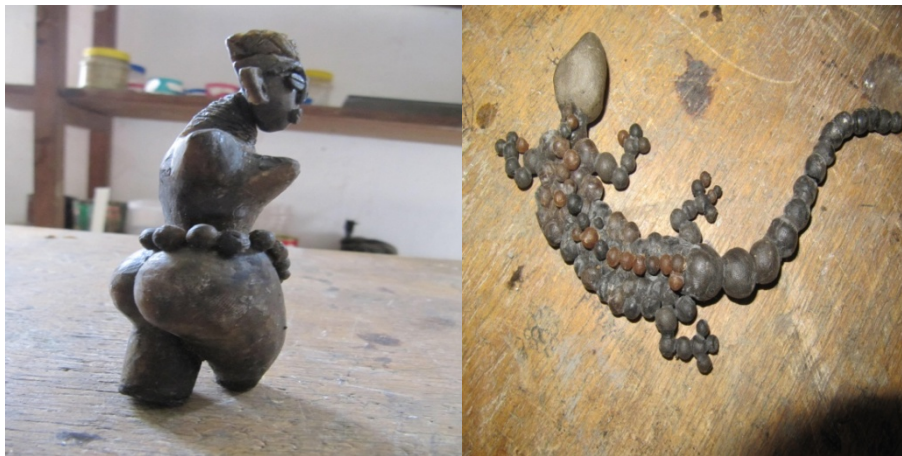
Figure 3. The African Fertility Doll

Figure 4: This lizard is also made of wax, was made from joining together different sizes of wax balls.