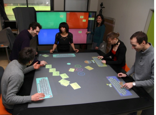
Figure 2. (Left) Six users around TATIN groupware with virtual keyboard – (Right) Six users around TATIN-PIC groupware.