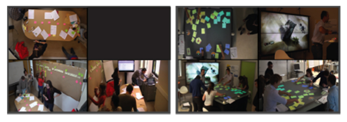
Figure 4. Comparative design observations during TATIN projects: control condition (left) and experimental condition (right)

Those observations are recorded with cameras. Audio is captured through directional microphones. The independent audio and video streams are synchronized after the observations, in a two or four camera view. Figure 4 shows an example frame of this work for both conditions.