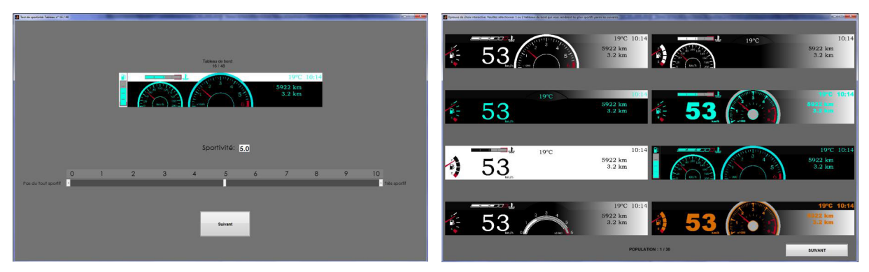
Figure 1. Graphical interfaces of the CA test (left) and the IGA test (right)

defined with a DOE software using the D-optimality criteria, and presented to the participants, one after another. In order to limit the order effect on the rating, the presentation order of the products was controlled and followed a Williams Latin Square. The graphical interface for the ratings is presented in Figure 1 (left). It shows the image of the digital instruments panel (in scale 1:1), a scroll bar with a 10 points Likert scale, which allows the participant to assess each product, and a "next" button to validate the score and continue to the next design.