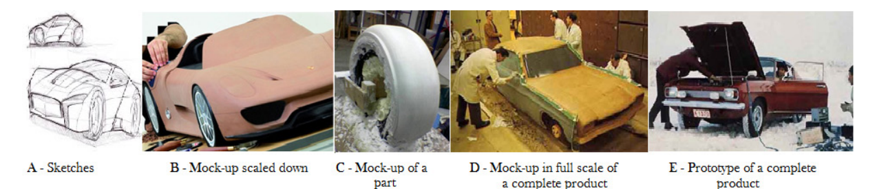
Figure 2. Boundary objects investigated (LINEWEIGHTS, 2010; VISEUDESIGN,2010; GTSPIRIT, 2010; BESTCARS, 2001)

The frequency of use of the BOs was identified for each phase of the cycle of collaborative community product development according to the community's internal reference model: Stage I, production selection; Stage II, OSD rationale (OSR); Stage III, 3D drawing and bill of materials; Stage IV, review/bids; Stage V, prototyping and testing; and Stage VI, production.