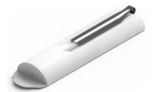
Figure 2: Device redesign based on design ethnography findings

dramatic redesign of the device as shown in Figure 2 (Mohedas et al. 2015). The significant changes emphasize the actionable nature of the feedback generated through data collection and the conclusions drawn from data analysis.