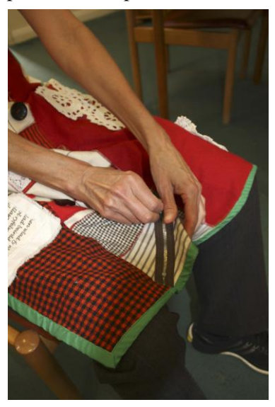
Figure 1. Dementia Apron

Research team members interviewed care staff and family members in order to identify and gather information about specific PwD to design for during the proposed participatory design workshop. Three specific people were identified: two men and a woman. A description for each was written in advance of the workshop identifying their individual preferences, interests and a little life history.