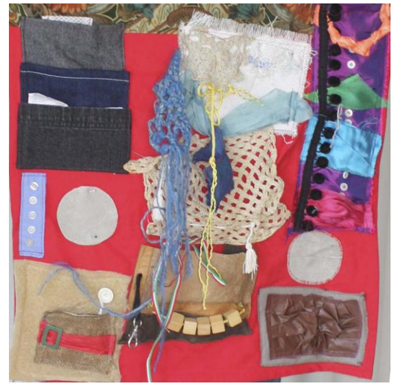
Figure 3. Dementia Apron – Ado

Group 2 focussed on working on a design for a PwD called Ado. They worked intensely, capturing written ideas on large pieces of paper developing a range of themes that they wished to represent in the design including Ado's preference for particular items of clothing, his various fields of employment and countries he had lived in. These themes were represented through bright silk scarves, the frontispiece of a blue business shirt, and a variety of men's suit fabrics (Fig 3). The textile elements within the apron were highly coloured and decorative incorporating stitched, knotted and embellished detail for fiddling with and to provide added sensory interest. In addition the blanket used conductive threads and fabrics to enable a soft contact switch to be embedded that could tap on and off with an easy hand gesture and produce light and sound responses.