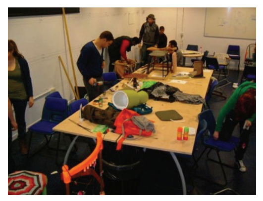
Figure 2. Experimentation in the studio

With a large number of chair constructions to reference and analyse, the de-briefing session unpicked the value of the project and introduce concepts from heritage and sustainability. This 'Crit' session was an important teaching aspect of the project. These themes included: