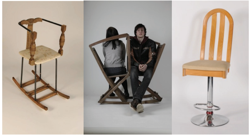
Figure 3. Final Chairs, 3 Days construction

The resulting objects were used in a group discussion starting with recycling, re-use and product lifespans leading into a broader debate on what was meant by Sustainable Design [7] [8].