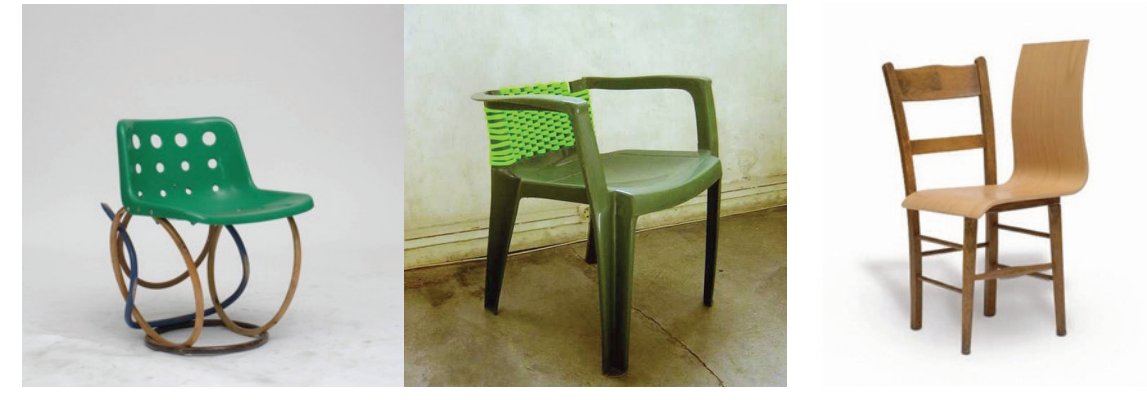
Figure 1. Work by Martino Gamper

The starting point for the students was intended to be very different in methodology from the processes that they had been taught in school.