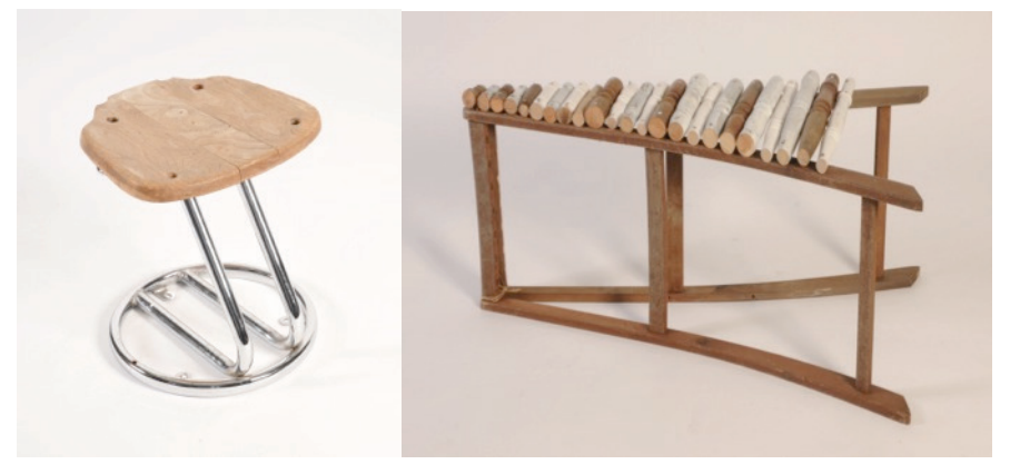
Figure 4. Final Chairs, 3 hours construction