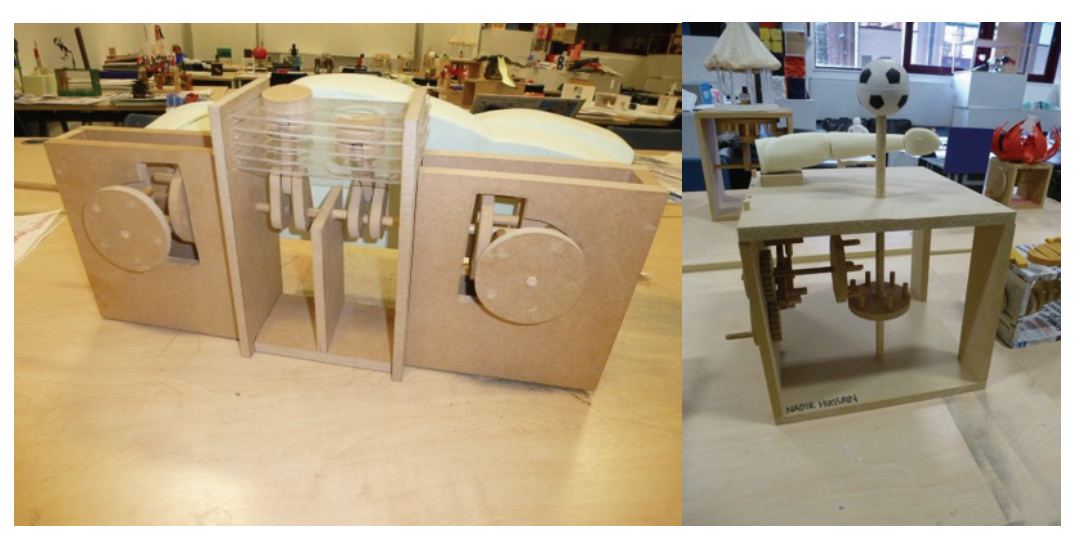
Figure 6: Automata, Final Models