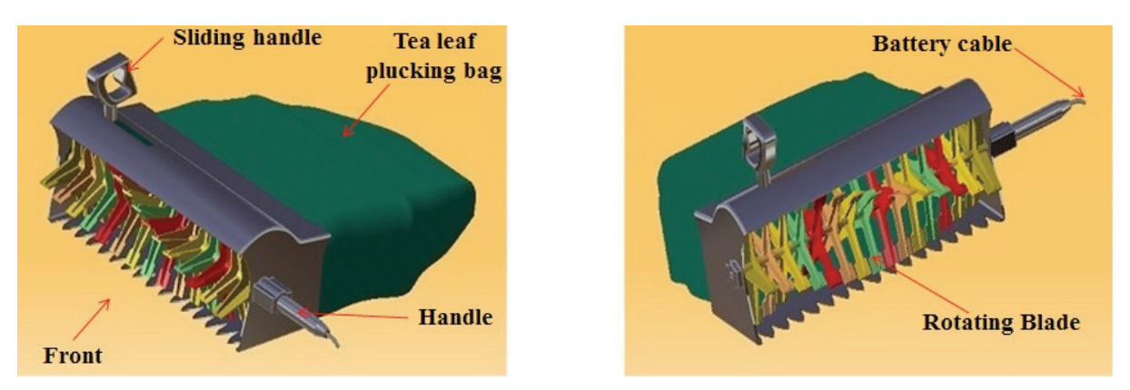
Figure 3. Battery operated Tea leaf plucking virtual model

Based on the study, a method was evolved for using VR in design education as a tool by design students. Design of experiments were undertaken to validate the method evolved by actually taking a virtual prototype in CAD model and evaluating and improving the design prior to actual prototyping. VR program was formulated to evaluate and improve a prior Virtual Prototyped CAD design of a tea leaf plucking machine, Figure 3 . Improved design was physically prototyped in both formats, prior to application of VR and after application of VR. Physical prototypes were tested in actual use and during the process it was found that physical prototype arrived after VR application was better than the one prior to VR application as assumed and thus a bridge between imagined model and tangible model was possible in terms of design experience.