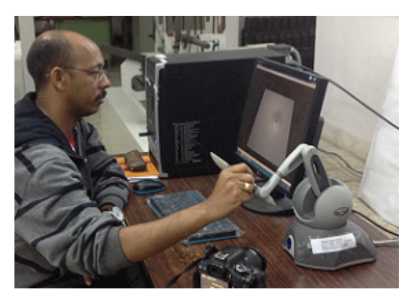
Figure 1. Haptic interaction with Virtual model