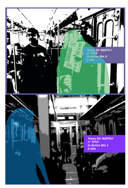
Figure 7. The movies showing in real time the life in stations and within the wagons

Finally, considering the two case studies, we can observe that interactive design is a contemporary discipline suitable for solving a large range of problems in our cities by means of solutions involving every day technologies that is easy to implement. The quality of the results achieved, in more complex cases than those outlined in this paper, depends fundamentally on the effective synergy of interdisciplinary skills and on the directorship role taken on by the designer.