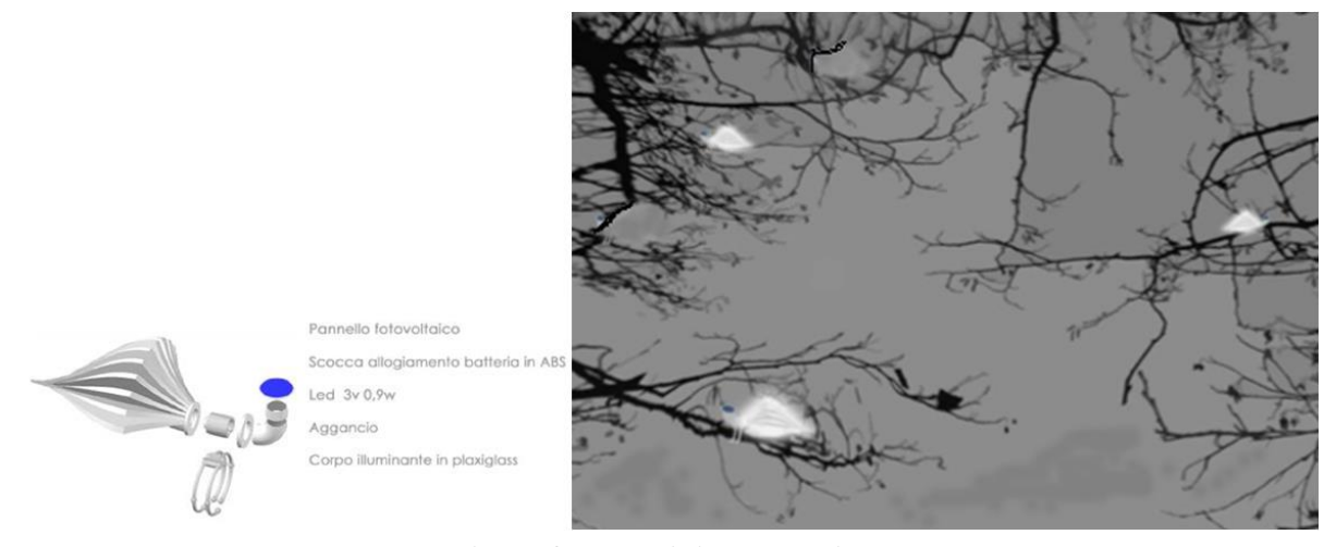
Figure 3. The mini LED device

The Sharewood project includes two intervention: a non-invasive intervention of lighting design – given the need for a low impact on the natural and historical environment – and a system of interaction based on a dedicated wi-fi all around the area of the Park. This system allows users present in the woods to communicate with each other and with a control and security system entrusted to the managers of the park. The lighting design is meant to inform the user of safe routes within the park, preventing users getting lost or finding themselves in unsafe zones in the vast area of the Wood. The mini lighting devices consist of led lighting which can take on different colors depending on the path to be indicated. Leds are powered by a small solar battery, autonomously providing energy to the system, which requires a minimum amount of energy.