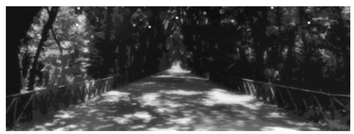
Figure 4. View of the Capodimonte Royal Wood with the lighting project in place