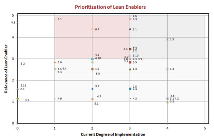
Figure 1. Process Model for Prioritization and Customization of Lean Enablers

To summarize, the final process model or algorithm seen in Figure 1 therefore requires a three dimensional assessment from the user to generate a customized and prioritized list of Lean Enablers, which are expected to make the biggest contribution to a specific program's most critical risks. Only minor prior knowledge from the user is required, other than program related, to generate the results with the presented semi-automated process model. Using an approach similar to a cost-utility analysis (semi-quantitative) further ensures a balanced representation of the results.