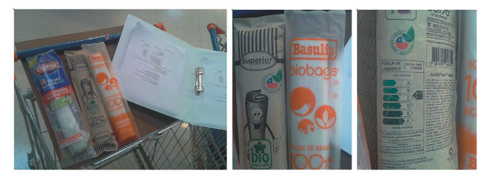
Figure 6. The protoype and the selected brands used for the comparative survey

In order to validate the strategy a comparative method was employed between the prototype and other sustainable products from the competition in the same category. The selected products used for the comparative survey were the "10-pack white 50 \times 70 \text{ cm} / 30 litters, garbage bag made with recycled and Oxo-degradable materials" from the brand "Virutex" and a "10-pack classic 50 \times 70 \text{ cm} , 100% organic polymer waste bag" from the local brand "Basulip" (Figure 6).