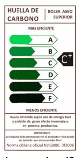
Figure 5. Qualitative Eco Label for environmental certification purposes designed to validate the strategy applied to the prototype

The first was a governmental qualitative eco label certification designed using a green colour, the image of a "leaf" and the words "Ministry of Environment – sustainable product" (Figure 4). The second was a quantitative eco label, designed as a Chilean environmental norm according to the carbon footprint indicator defined by the EPD system for the product category used for the prototype. The same strategy used to communicate the energy efficiency on electrical appliances was applied to the design of this eco-label, because the consumers already know how to read that kind of label and this fact could facilitate the consumers' comprehension (Figure 5).