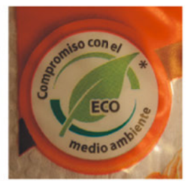
Figure 2. Details of the use of a "leaf" and "green" colour in sustainable products at a local market