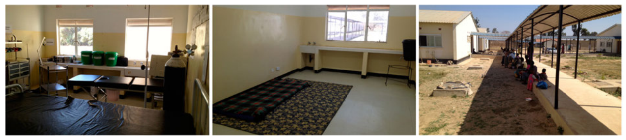
Figure 11. Emergency room Figure 12. Physiotherapy room Figure 13. Hospital grounds CDH

The hospital in Chongwe, Chongwe District Hospital (CDH) is newly built. It is a small single story complex, with basic emergency room, male, female, maternity and paediatric wards, a small basic physiotherapy room and a building ready to hold theatres (unopened due to a lack of theatre staff). The hospital is affected by the extensive power cuts of Chongwe, which may last for an hour or the whole day. Whilst the majority of hospital workers speak good English, within the town the average person has very poor English. The team spent extensive time with staff, getting to know them, the hospital, the level of care available and the difficulties they encounter. This was achieved by undertaking extensive conversations, interviews and discussions in the hospital and its neighbouring environment.