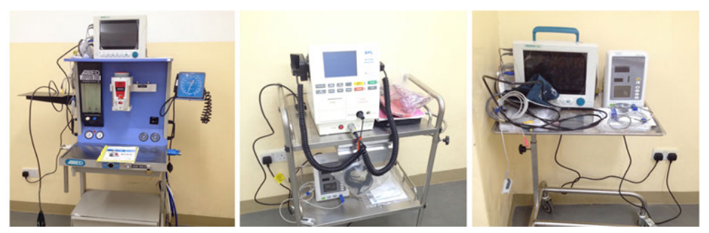
Figure 21, 22, 23. Equipment after removal from storage CDH

Road traffic accidents (RTAs) are a major issue: everyone is advised against night driving. The Great East Road runs from Lusaka, through Chongwe, onto Malawi. Here the incidence of RTAs is extremely high. For example in August 2012, a bus carrying 34 passengers was involved in a RTA. 13 people died and 16 suffered serious injuries. In early 2013, a bus carrying 74 passengers was involved in a RTA. Over 50 passengers died and 10 had serious injuries.