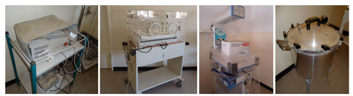
Figure 17, 18, 19, 20. Equipment in Storage in CDH

Electronic equipment is a problem. Hospital grounds have two rooms of expensive unused equipment donated without instructions or training, with unsuitable power voltage and missing components. An American ultrasound machine was found to be broken because of a local power surge.