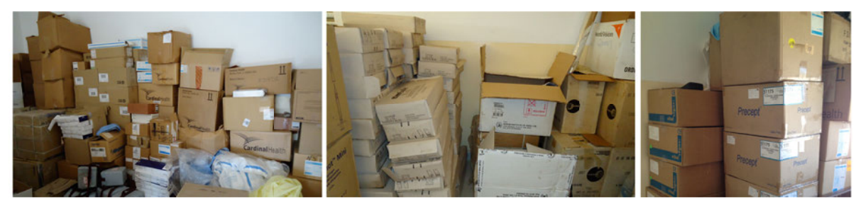
Figure 14, 15, 16. Storage of consumable medical equipment CDH

Electronic equipment is a problem. Hospital grounds have two rooms of expensive unused equipment donated without instructions or training, with unsuitable power voltage and missing components. An American ultrasound machine was found to be broken because of a local power surge.