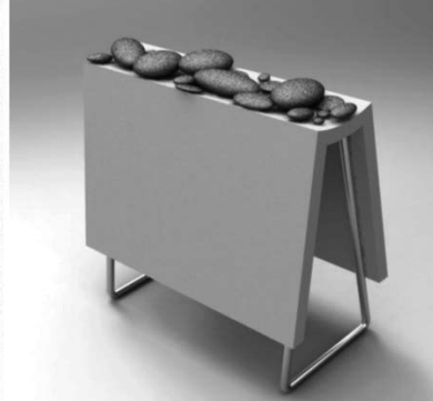
Figure 2. (left) Testing experience with heated stones, (right) Spa radiator, Siri B Persen