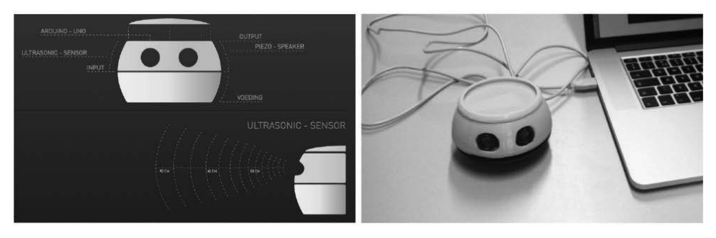
Figure 3. Alpha prototype 'stuff protector' by one of the students

At the end of the course an exhibition is organized showing the alpha versions of students' (physical) prototypes (see Figure 3 for an example). Students from all classes assess each other's work during this exhibition.