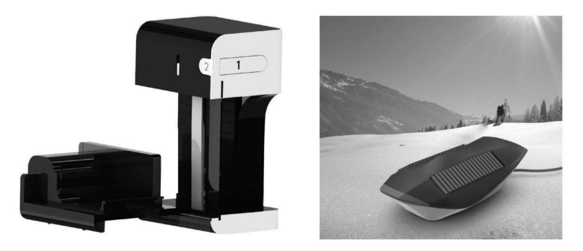
Figure 6. Renderings of the slicer and the snowmole created by cADP students

the person, while the robot is looking for its way to the top. The entire technical complexity never existed in the cADP project previously. The prototypes also had a tremendous quality: the prototype slicer was able to cut all the ingredients for a sandwich during the final project presentation. Both products are shown in Figure 6 and 7.