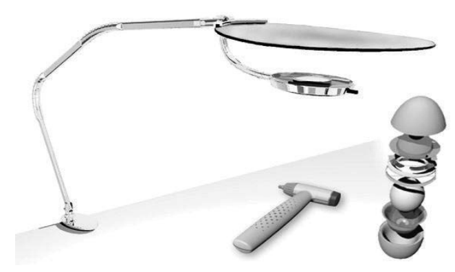
Figure 1. Renderings of the products created by the first cADP students

The products are characterized by a relatively low complexity. Tasks were, for example, integrating two functions in one product (Figure 1) or conventional measuring tapes combined with a separate digital display and a few buttons for easy handling (Figure 2).