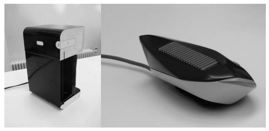
Figure 7. Prototypes of the products shown in Figure 6 created by cADP students

In the most recent cADP everyday objects were considered. The goal was to make the everyday's life more simple, pleasant, independent and/or effortless. A walking aid for older persons was designed with a mechanism on the front wheel, which makes it possible to overcome curbs easier. Furthermore, a conference table was designed and built, that can be transformed to a pause game easily by simply clicking out game play elements and cushions. Furthermore a new type of wireless ironing concept was designed that works with induction. Here the students build a fully functional prototype (Figure 8). In addition all groups used some former prototypes of lower fidelity for evaluation studies parallel to the ongoing design process. The main goal of these first prototypes was to confirm that their potential users got the same idea about the products as the designing students have.