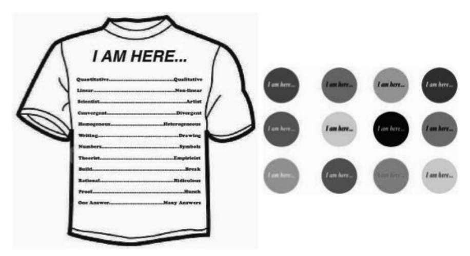
Figure 1. T-Shirt Exercise Tools (T-Shirt and Coloured Badges)

The project's first workshop involved a number of creative activities, which aimed to examine the disciplinary perspectives of each participant that would, in turn, allow comparisons to be drawn between them. The selection of creative activities was carried out after a review of workshop techniques from the experiences of network members and action research techniques. The first exercise involved each participant wearing an identical T-shirt with a series of conceptual linear spectrums printed on it such as "Scientist.....Artist", "Build......Break", and "Proof......Hunch" (Figure 1 - left). Each participant was asked to pin a badge labelled "I am here..." (Figure 1 - right) where they felt they belonged on every spectrum.