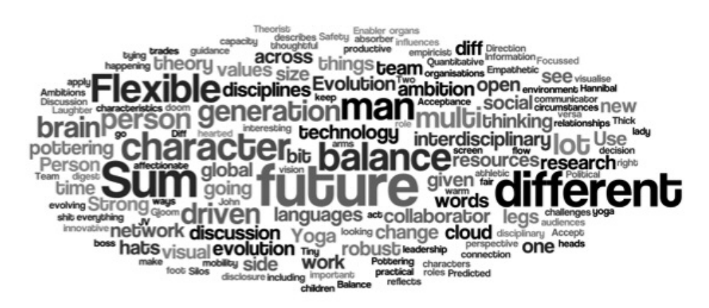
Figure 4. Wordle Word Cloud of the Future Interdisciplinary Character

Participant M stated a balanced two heads of theory and funding driven skills would be desirable. This participant emphasised the importance of "balance" as an attribute across several spectrums including "theorist – empiricist", "teacher and leader as well as a collaborator", "quantitative – qualitative", whilst being "flexible and robust". Participant H approached the exercise with words, highlighting challenges for the future. Participant H stated "knowledge would be very important" and that the future interdisciplinary character would require a "wide vision and communication". Furthermore, the future interdisciplinary character would need to be "adventurous, flexible, possess a thick skin for protection, be relaxed, be able to laugh and be sociable, have drive, and be well connected". Participant C based her portrayal of the future interdisciplinary character in terms of the ideas and values she has for her children. Thus, participant C stressed that this person should have "political and other values that are based on being fair and decent". Moreover, the future interdisciplinary character should be "committed, perceptive, thoughtful, big-hearted, warm, loving and affectionate". Also "energetic and athletic, and possess abstract thinking but be able to apply it to a future generation".