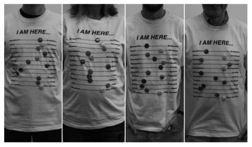
Figure 2. T-Shirt Exercise (participants' completed versions)

The next exercise, "The Future Interdisciplinary Character", challenged the participants to think about the future, complex, inter-connected world we are set to inhabit and to think about what skills, knowledge and experiences will be needed to best address these issues. Here, each participant was given a "blank character" (Figure 3 - left) and asked to complete it so that it fully described the "The Future Interdisciplinary Character" who might be best positioned to address the world's future challenges.