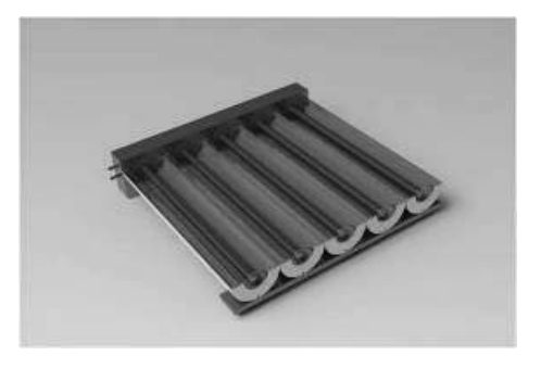
Figure 1. Team hotbox