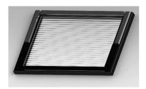
Figure 4. Team Copernicus

Team Copernicus presented a design based on multifunctional Velux® [11] window (Figure 4) that would double as a solar thermal collector using and array of semi- transparent polymer. Since there is compromise in the transparency of the windows, this design shows much promise in the case where the windows are to be used as skylights, compared to their usage as normal windows.