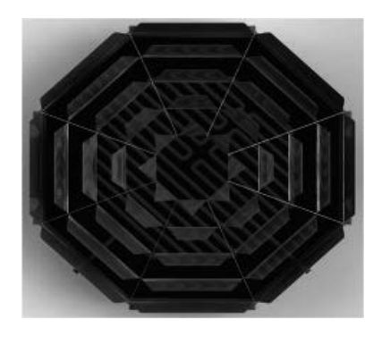
Figure 2. Team Lux

Team 2, named Lux, presented a design based on a bimetal laminate that would open on periods of high insolation in order to heat up the interior network of piping, and would close once insolation dropped so as to preserve the heat gained (Figure 2). This design appears to be aesthetically very appealing but also provides a radically new approach to solar collectors. According to the team's specification the laminate has working angle of more than 90 degrees. Material limitations exist for this concept as well as issues for it's life span arise based on the continuous mechanical stress that the bimetal laminate will experience over a typical solar thermal collector's lifetime. Another concern is with the safety of the product in situations when the bimetal petals are open.