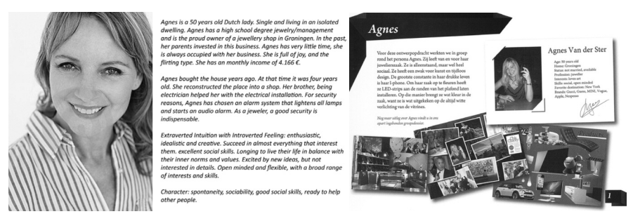
Figure 2. On the left one the personas as presented by the company Niko, on the right a result of the empathy phase: a moodboard created by students to gain insight in the character and the preferences of the persona

Sixty design students participated and were evenly divided over the three target personas. Each of the students had to develop a dedicated LED control for a appointed persona.