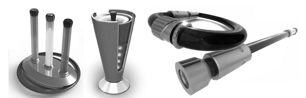
Figure 4. The Tri-C.L. concept, The cocktail concept and the Glow stick concept

The Colour Cocktail concept (Fig. 4, middle) for persona Karen refers to a cocktail drink. The light colour is chosen by 'stirring': guiding the straw on top of the remote into the chosen colour direction. Light intensity is created by stroking the side of the cocktail goblet.