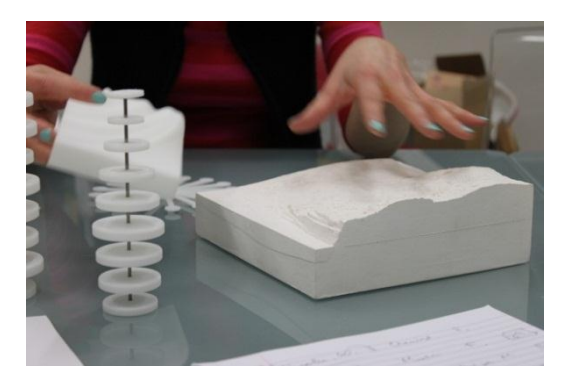
Figure 6. User testing the data-objects

want to decode the object". Another participant "really liked the interpretative nature of the large plaster object" and found it more engaging "not black and white" (Fig 6.).