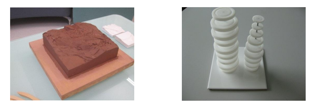
Figure 3 and 4. Developed models – Landscape concept in clay and Jar lid concept, Rapid Prototype model.