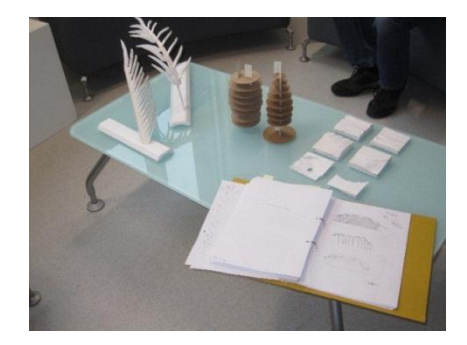
Figure 2. Test models showing 3 initial concepts.