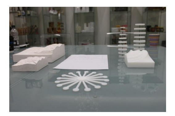
Figure 5. Data-objects on table ready for user testing.

meaning/nature of the object and what information/data it might represent were asked. After two or three objects had been discussed, a graph of the original data was shown and explained, after which the remaining objects were examined and the initial objects were returned to.