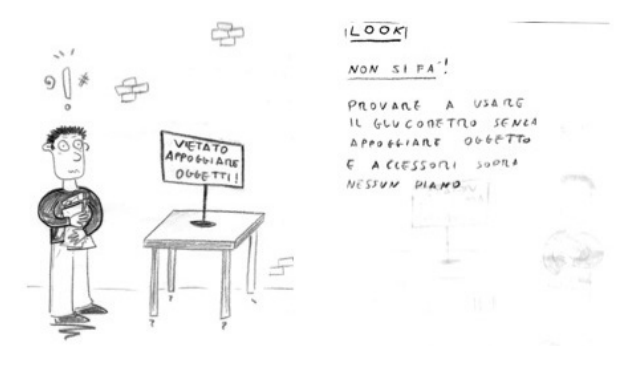
Figure 2. Preliminary sketch for the design of a Look card. The purpose is to observe users while using a glucometer without the support of a surface (by A. Appiani).

The result was unique and educationally stimulating. In the following pictures it is possible to see the development from ideation to production of some cards.