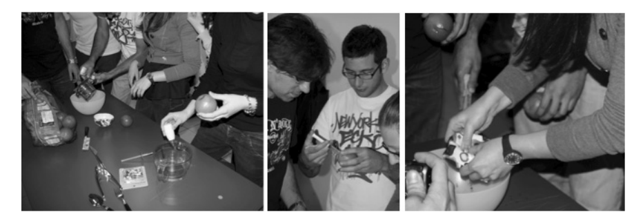
Figure 5. Trying to extract the juice from an orange.

As in the previous case, the ideation on the card Try for the design of a juicer (see figure 5), the group decided to use a lateral thinking approach. During the brainstorming session, they selected various items meant to help extract the juice from an orange and create a fun atmosphere able to release spontaneously the flow of ideas.