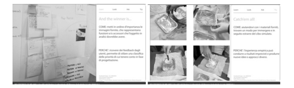
Figure 6. Cards Learn and Try for design a deep fryer (by LoIacono, Mareddu, Miraldi, Molana).

The cards can be used to identify specific characteristics for the product and to refine some of the earlier design choices. The card Learn of the design team for a deep fryer show a visual approach, for the selection of the functions that should necessarily be preserved in the product, by providing a selection of images to be ordered by relevance. The same team also decided to simulate the immersion of food to be fried using small containers full of water where the "users" had to dip frozen potatoes using the material made available by the design team (nets, skewers, wooden spoons, ecc).