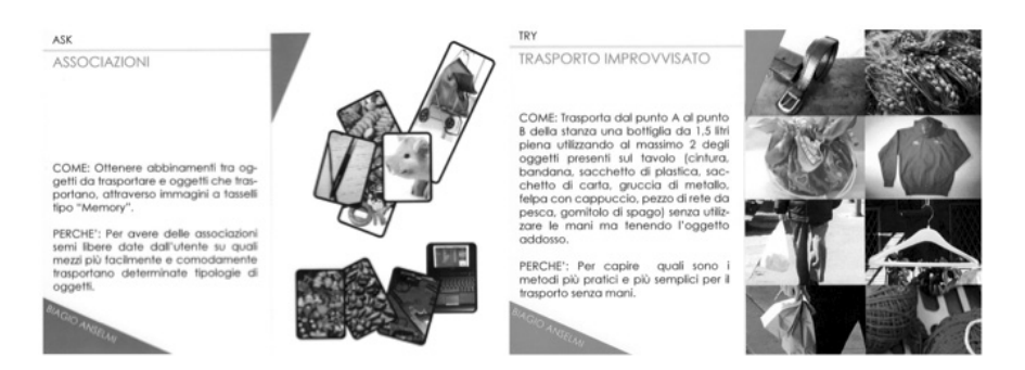
Figure 4. Cards for the design of a portable aerosol (by B. Anselmi).

As in the previous case, the ideation on the card Try for the design of a juicer (see figure 5), the group decided to use a lateral thinking approach. During the brainstorming session, they selected various items meant to help extract the juice from an orange and create a fun atmosphere able to release spontaneously the flow of ideas.