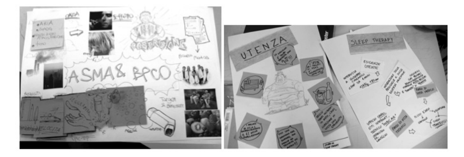
Figure 1. Mind map of problems involved in asthma (left) and sleep therapy (right).

The exercise is organized over three days. The first day, the preparation of the creative session, starts form the graphic interpretation of the information collected and the definition of the problem to be explored during the activity. The leading group would have 10 minutes (max.) to introduce synthetically the topic. Students are invited to use mental maps, a technique of graphic representation of knowledge introduced by psychologist Tony Burzan around 1960. A map is a highly effective tool of abstraction and mental organization, it enables students to articulate, organize and structure information, thus supporting and easing creative thinking.