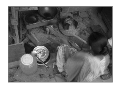
Figure 2. Leo Double Pot stove by Prakti Design.