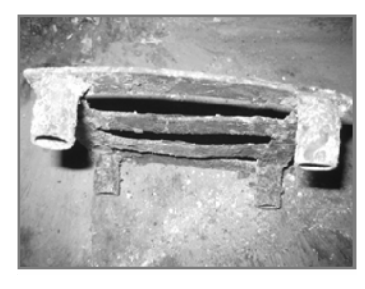
Figure 4. Regulator after 8 weeks of use.

During the research phase, ten slum households with traditional south Indian cooking practices allowed authors into their living spaces to take measurements of wood-burning chulha dimensions and volunteered to test cooking products. The regulator insert prototype design was fabricated from scrap iron at a local metal shop in accordance to the stove measurements. After a quality check, prototypes were deployed to six households. Among households, two engaged in commercial cooking activities and all six in domestic cooking; four cooked inside and two regularly cooked outdoors. A brief demonstration was given to each user on how to position the regulator insert within the chulha and