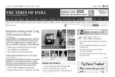
Figure 1. English Website.

The users were asked to navigate through the regional language website (Figure 2/ Figure 3/Figure 4/ Figure 5) for 10 to 15 minutes, where they could check out links, ads, read news etc. They could perform any activity which was on the website. At the completion of their navigation time they were given a questionnaire (4.4.1) consisting of questions based on the navigation and usability of the site. They were asked to point out issues they did not find easy to work within the website. These ambiguities are shown in Table 1.