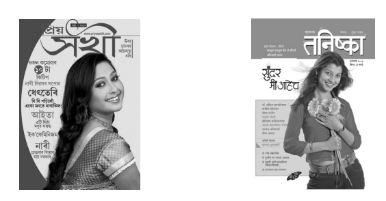
Figure 9. Assamese Magazine Cover. Figure 10. Marathi Magazine Cover.