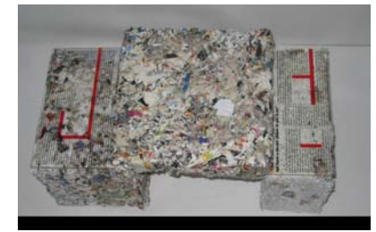
Figure 4: End product views

The role of the community in the delivery of this design can be widened from the initial paper collection, described here to involvement in the making process. For example, while the cast for the production of different sizes of paper mass blocks should be produced in a skilled carpenter's workshop, it is suggested that this should be selected as a craftsperson willing to cooperate in creating the final product. Unskilled workers, such as unemployed members of the community, can then be involved in the construction process. The whole design and making process is both creative and has the potential to increase the community's awareness about environmental issues.