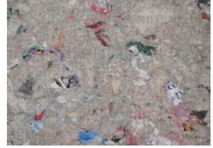
Figure 1: Waste paper