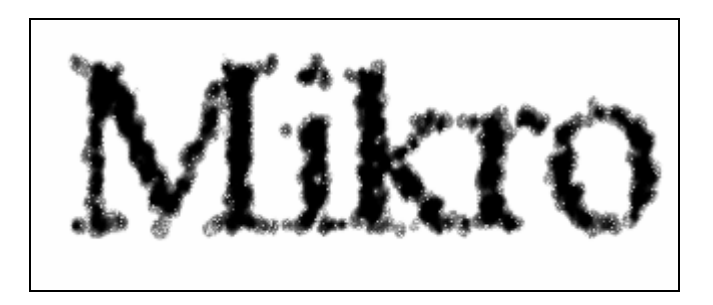
Figure 2. Ink Jet ink spreading across the paper (Device: HP 3500CP). Magnification:750%