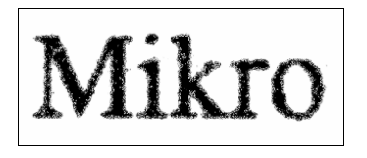
Figure 1. Text printed with Xerography based on powder toner Device: Xeikon DCP 32/D, Magnification: 750%

It is known, that today, on the digital printing market, leading place is held by two technologies: the Xerography and the Ink Jet, because beside their printing speed they also give the best printing quality. In Xerography, two branches of this technology are developed, depending upon the kind of toner which they use. Powder toner and liquid toner are used, and sizes of those toners particles differs from the manufacturer to the manufacturer. Powder toners have larger particles (Figure 1), and their diameter ranges from 6-20 \mu m, while a liquid toners usually are finer and have the particles diameters smaller then 2 \mu m. Pigment particles size which are used in the Ink Jet technology can be compared with the particle size of liquid toners that are used in the Xerography. From these data, it is easy to conclude that the Ink Jet technology and Xerography with the liquid toner have the predispositions for the more precise printing then the Xerography with the powder toner, because of the smaller pigment sizes. However, because of the specific way of printing, Ink Jet the technology is not precise as Xerography is. Ink Jet nozzles, which scatter the ink droplets, simply can not place ink pigments over very small area. Ink is dispersed widely and so loss of precision accures (Figure 2).