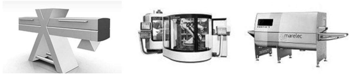
Figure 5. Extract from the 'don'ts' mood board