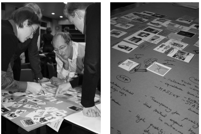
Figure 3. Illustrating the mood board creation process

To illustrate this procedure, the example will be given of machine building company that, based on the above methodology, defined their brand values as: "user friendliness, solution driven, added value for the customer, visual quality, empathy and personal approach". Based on this, mood boards were made collecting good and bad examples of how these values could be physically translated into the product design.