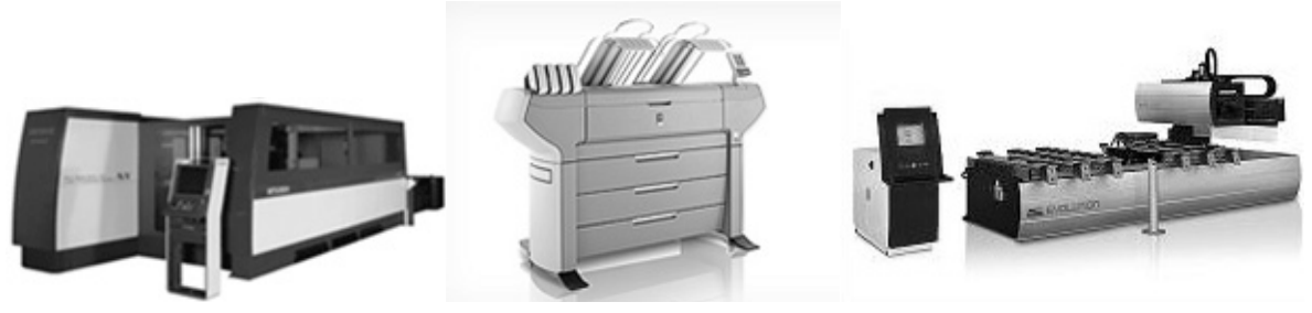
Figure 4. Extract from the 'do's' mood board