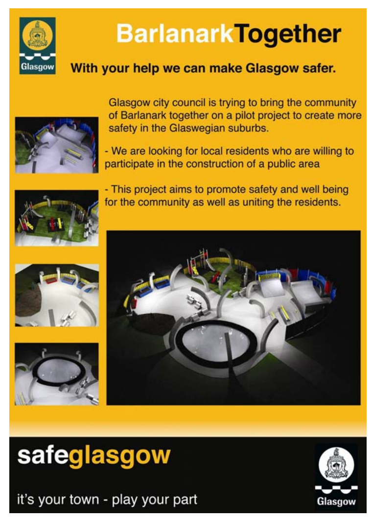
Figure 3. Student Concept Poster for Barlanark Design Solution

In this case the students have understood that the improvement of public places can have a significant impact on the conditions of life within communities and can instil a sense of civic pride in residents and convey a much improved social image as corroborated by Madanipour [6]. The recognition of this can be contributed to the creative approach the group took to addressing social issues by exploring the root causes of such issues and arriving at a concept which not only reacts to problems but could also provide the means to make progress. CABE [7] highlights how the maintenance and design of parks and public green spaces affects people and uses The Hub in Regents Park, London as a positive example of such a space. It is important to aspire to have similarly praised examples of public parks and spaces in more disadvantaged areas.