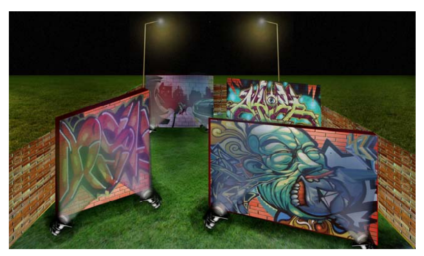
Figure 5. Student Design Solution for Calton

The solution attempts to reverse the negativity of vandalism by putting it to positive use. The group propose an outdoor graffiti gallery in Baird Square to encourage the use of a designated space for this activity and to detract potential vandals from defacing the public realm elsewhere. The space would be brightly lit in hours of darkness and is intended to facilitate a sense of ownership and responsibility. A visualisation of the concept is shown in Figure 5 below. Although the concept has its shortcomings the creative approach helped the group to consider means of making positive contribution by directly utilising a negative issue and could perhaps have a more positive effect if implemented as part of a package of measures. Alternatively, the idea could be implemented as part of a community scheme like Graffiti Art Programming [10] in Winnipeg, Canada which aims to promote the positive aspects of youth art and to provide environments for young people to express themselves creatively.