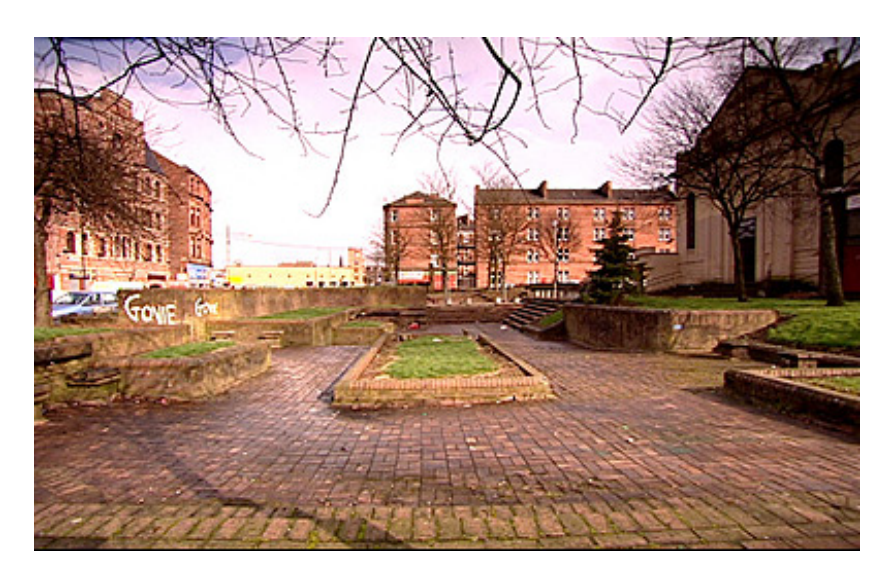
Figure 4. Baird Square, Calton

was suggested that if the Local Authority show little interest in the area in terms of maintenance that the community feel that acts of vandalism within such an environment, for example in Baird Square will make little difference. In an interview with the Authors, Constable Rob Hay [9] (Regeneration Liaison, Strathclyde Police) asserted that crime is a way for certain members of the community to manifest their discontent with their environment.