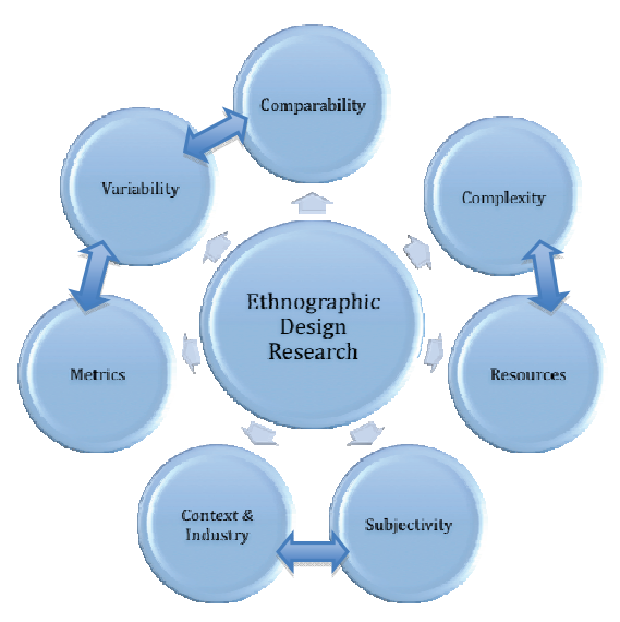
Figure 1. The Seven Problems Identified in Ethnographic Design Research (EDR)

Based on a review of the existing literature, particularly [1][3][18] several of the key problems have been identified. It is these problems in combination that create the challenges of undertaking ethnographic design research. They tend to hinder the communication, generation and reuse of data in research and also negatively affect the applicability, uptake and perceived value of the research in industry. Figure 1 shows the seven identified problems and their relationships to each other. Each is now discussed with a combination of emerging approaches for design observation.