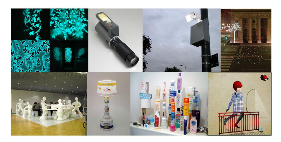
Figure 2 Interdisciplinary design examples (clockwise from top left: loop.ph, Troika, Moritz Waldemeyer, Simon Heijdens, Greyworld, Daniel Eatock, Helmut Smits, Atelier van Lieshout)

Table 1 and Figure 2 highlight the interdisciplinary nature of contemporary design. This emerging hybridised design work is illustrated best by the following eight perhaps somewhat lesser known designers and design teams.