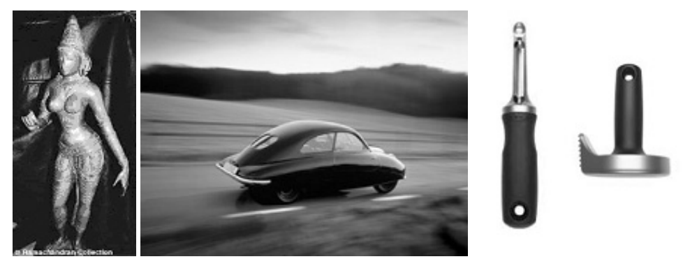
Figure 2 The Goddess Parvati – Saab 92 – OXO peeler and Meet Pounder

"rasa" of a particular shape, color, etc. For example, consider the Hindu sculpture below. They argue that the artist has abstracted the female body shape, and exaggerated it in a direction that takes it away from the male body shape, thus making the sculpture more aesthetically pleasing."[13]