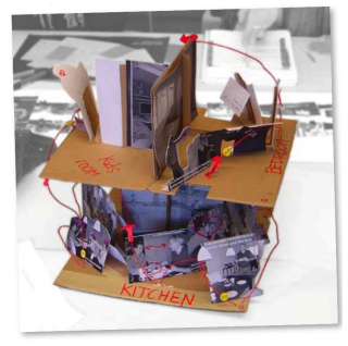
Figure 5 Rich evocative visualizations in data gathering (user workbook about shoe experiences, from [9]; 3D storyboard about a family's morning rituals; from [11])