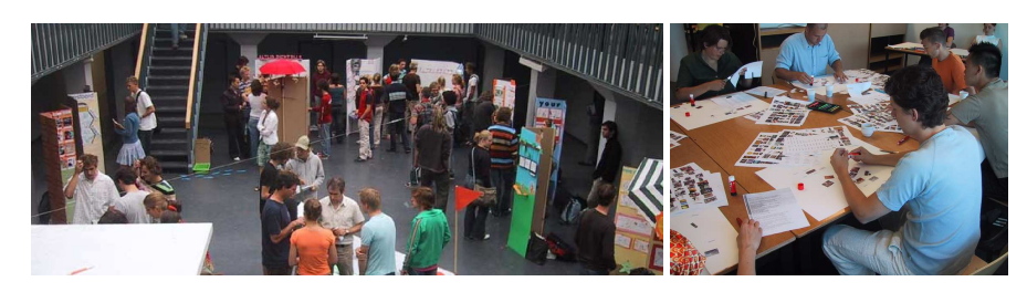
Figure 4 Poster presentations in BSc course; group session practical in MSc. Course.

Also we set up elective courses which involve industries and research projects, with small groups of motivated students. Such projects can focus on specific experiences, such as a study into the experience of shoecare (Figure 5, left); or they explore theoretical issues of one of the phases (see Figure 1 and 3), such as novel ways to communicate user experiences (Figure 5, right). This helps to ground our education and research into the needs of industry, and at the same time helps to inform industry with the newest techniques in this area. Such elective courses have to be conducted on a small scale, because they combine education, practice, and research and require intensive involvement from industry and researchers.