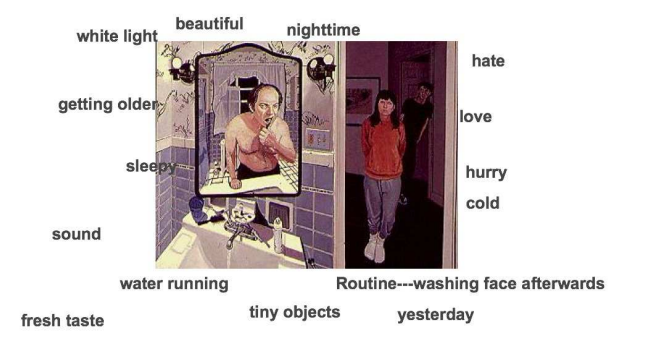
Figure 1 Elements of the context of brushing one's teeth.