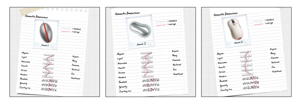
Figure 2. Use of semantic dimensions to illicit user perceptions

In the latter stages of the module, students develop small semantically problematic design projects, enabling them to demonstrate their acquired competence. They apply existing design methods (or articulate new ones). The projects results in something sufficiently tangible to be evaluated relative to the initial intentions.