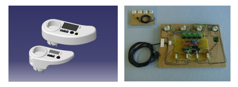
Figure 3. Form prototype of integrated cognitive sockets (left) and functional prototype of cognitive power strip (right)

The first seminar during the summer semester 2007 (April-July) was run in collaboration with the energy company E.ON on the topic of cognitive products to promote energy savings in the household. Ten students (nine mechanical engineers and one electrical engineer) in three teams attended the seminar. Two teams focused their product proposals around the general idea of cognitive power strips and sockets that respond to user behavior and save energy wasted by electronic devices in standby mode (Figure 3). The third team focused on one typical electric energy consumer in the household, the refrigerator, developing a cognitive add-on product to reduce wasted energy from opening and closing the refrigerator throughout the day. This team is attempting to patent their product and established a startup company to develop it receiving seed funding from the German government.