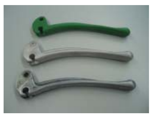
Fig. 4. Prototypes produced with use Vacuum Casting technique: a) silicone mould with wax model; b) brake lever: from resin, from low melting alloy, original – aluminum.