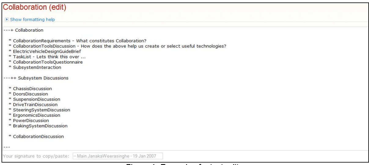
Figure 1. Example of a text editor

While this is a powerful tool for the collection of information, there is also a large potential for misinformation . There is no system in place to validate the information that someone may put on a wiki. A good example is Wikipedia . This encyclopedia wiki has rapidly become a resource for many people for quick information on various topics, but since the information in Wikipedia is provided by diverse users, there is no way of guaranteeing its accuracy [3].