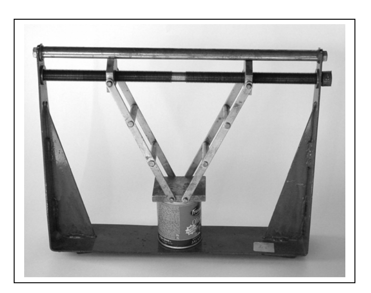
Figure 3. A student engineer's can crusher

The machine shown in Figure 3 was designed by a student with an 'A' level background in mathematics and physics who was enrolled on a course in mechanical engineering. An examination of the device and its performance characteristics provides an insight into the strategies adopted by the student in attempting to design a better can crusher. It is evident that the design is inspired by personal experience of using the popular design of car scissor-jack shown in Figure 4 - all elements of the student's device have been adapted from it.