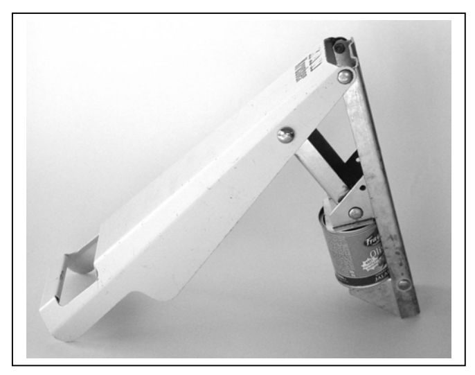
Figure 2. A proprietary can crusher

action for a steel pet food can and that a peak force is also needed at the end of the cycle for the final stages of compression. For steel drinks cans smaller peak forces are required, but the forces need to be applied over a longer stroke.