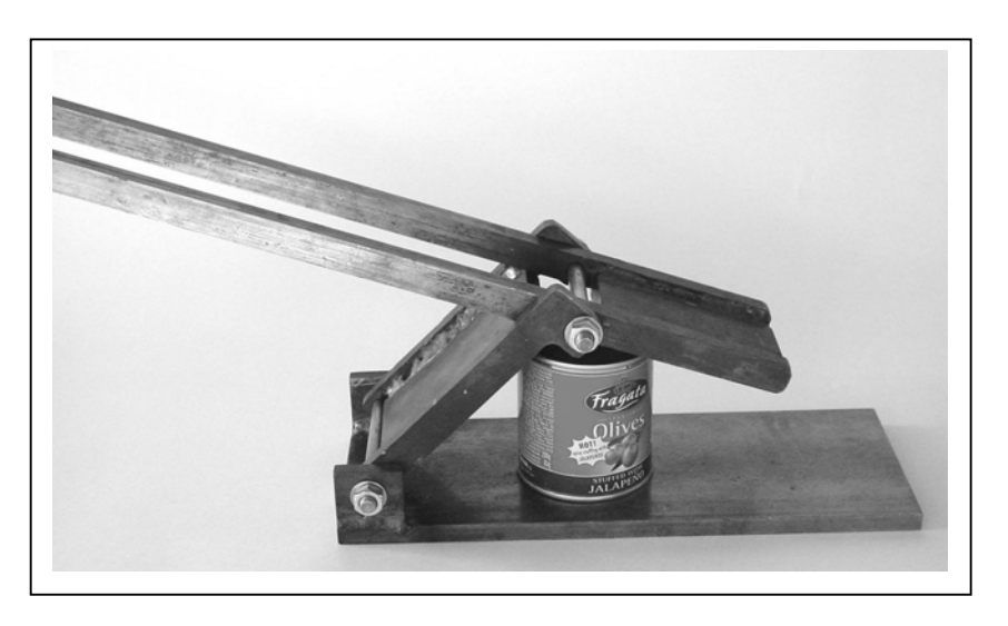
Figure 5. A student designer's can crusher

Industrial designers find it easier to generate and communicate ideas for solutions by reacting to and criticising existing product designs. Industrial designers typically use product-focused strategies where the problem is explored and understanding of it developed through an attempt to produce solutions that are demonstrably identifiable as products. The tendency to develop understanding through exploring design features of potential product solutions generates an inseparable relationship in the mind of the designer between the perceived problem and its solution.