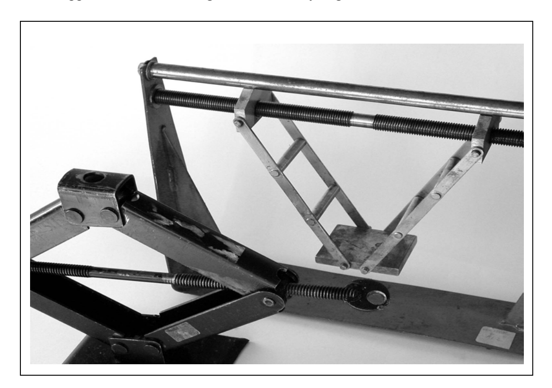
Figure 4. The proprietary scissor jack used as a source of ideas

start of travel the linkage actually reduces the MA provided by the screw thread. The main benefit of the linkage at the lower end of its travel is to improve the rate of ascent of the jack. The MA provided by the screw thread is not improved by the linkage until the angle between the lower and upper arms of the linkage exceeds ninety degrees.