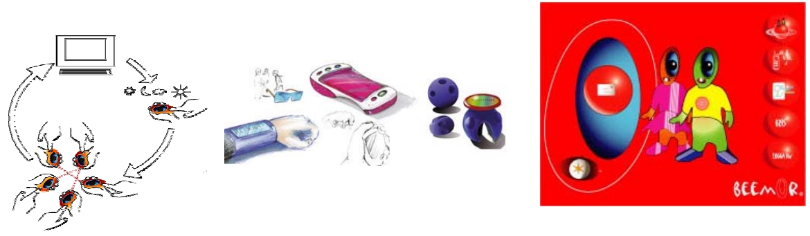
Figure 2. The Beemor project

The concept consists of a web site and small handheld units that will be used by the children as a physical link to the imaginary world of the alien Beemor. The school provides the units and the children use it as a complement to ordinary teaching