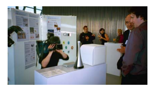
Figure 1. TED exhibition in London.