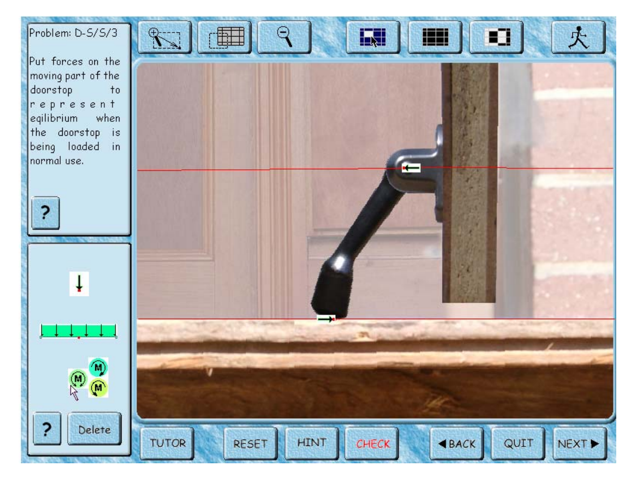
Figure 1. Appearance of MOMUS screen during an attempt to solve a problem

The Tutor keeps track of the number of times that an identical 'error' occurs, and provides access to second and third level 'hints' that the educator has prepared. The student has no direct access to the 'target' solution, or any other 'good' solutions that have been stored, so the hints and feedback have to be constructed by the educator to direct students toward the target, and the target solution needs to have a feedback comment that identifies itself as the termination of the problem. In this way it was intended that the Tutor could follow a similar structured approach to that of an experienced human personal tutor.