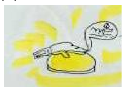
Figure 3. Concept sketch of the Identity Pebble